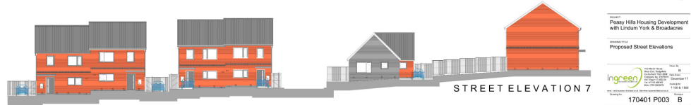
STREET ELEVATION 7