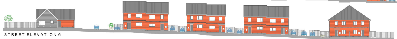
STREET ELEVATION 6