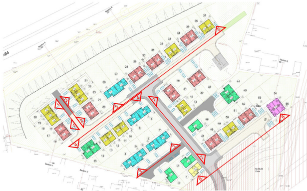
Site Plan with Elevation Key - Scale 1:500