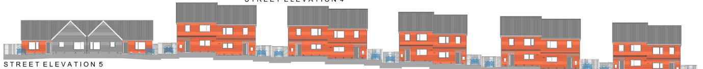
STREET ELEVATION 5